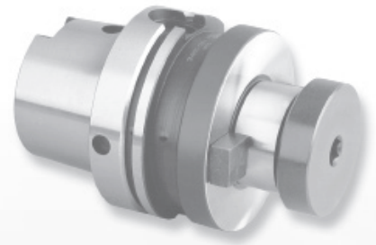
BALANCEABLE HEAT SHRINK